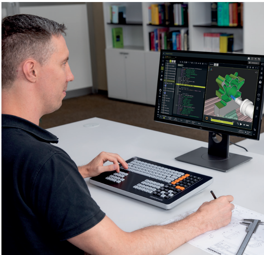
TNC7 programming station keyboard

One special benefit: nearly all software options and—on the iTNC 530— FCL functions available for the control are fully enabled on the TNC programming station at no extra charge. This enables users of the licensed versions and the free demo version to amply test all functions and then decide whether an upgrade on the machine is worthwhile.